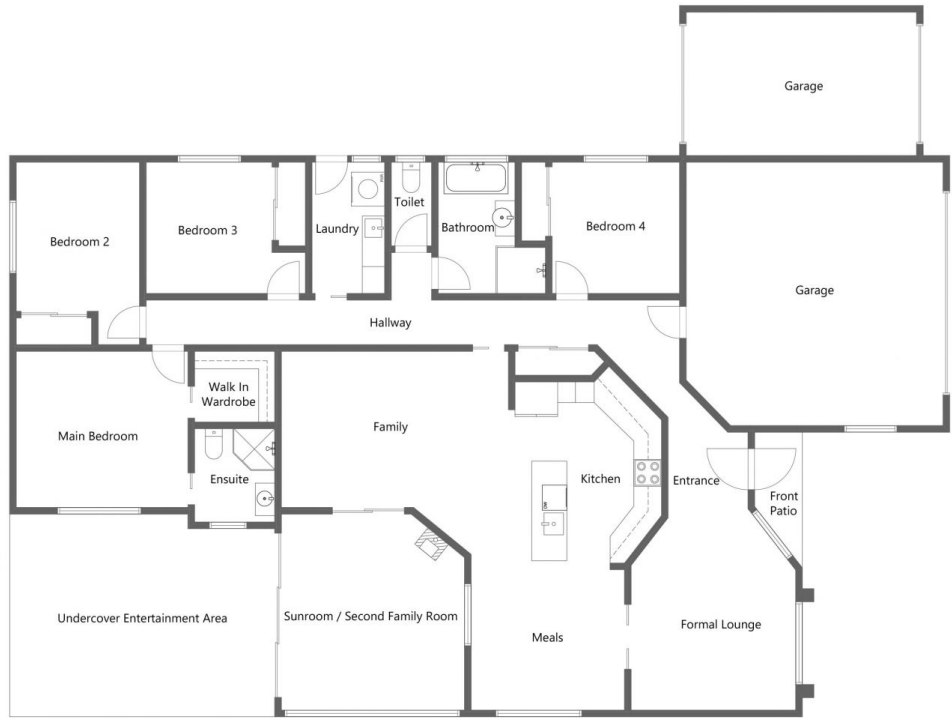
[ ]Ground floor