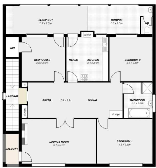
FIRST FLOOR (RESIDENTIAL)